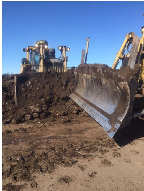
DOZER CLEANING DOZER BLADE