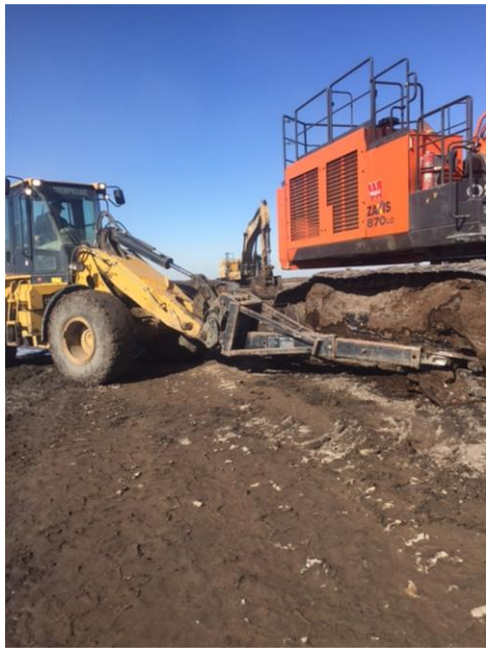
WHEEL LOADER & JIB ATTACHMENT