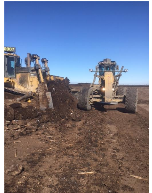
GRADER CLEANING DOZER BLADE