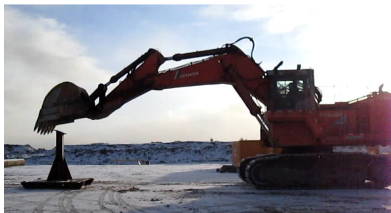
EXCAVATOR & SCRATCHING POST